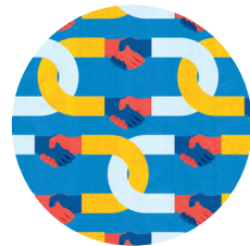
Collaboration and Partnership

The playbook provides a roadmap for accelerating local housing supply with strategies for collaboration, construction and development, finance, and land use and regulations.