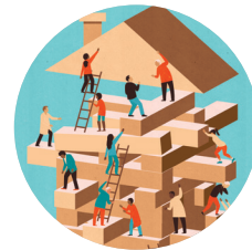
Construction and Development