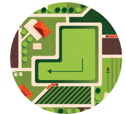
Land Use and Regulations