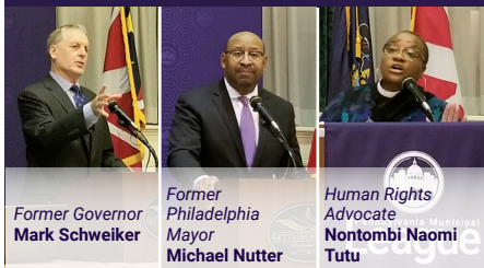
Former Governor Mark Schweiker