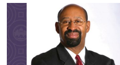
MICHAEL NUTTER 98th Mayor of the City of Philadelphia