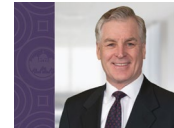
MARK S. SCHWEIKER 44th Governor of Pennsylvania